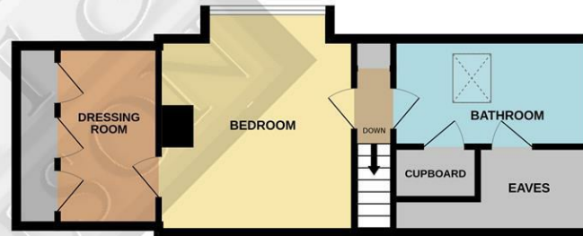
TOTAL FLOOR AREA : 1537 sq.ft. (142.8 sq.m.) approx.

Whilst every attempt has been made to ensure the accuracy of the floorplan contained here, measurements of doors, windows, rooms and any other items are approximate and no responsibility is taken for any error, omission or mis-statement. This plan is for illustrative purposes only and should be used as such by any prospective purchaser. The services, systems and appliances shown have not been tested and no guarantee as to their operability or efficiency can be given. Made with Metropix ©2025