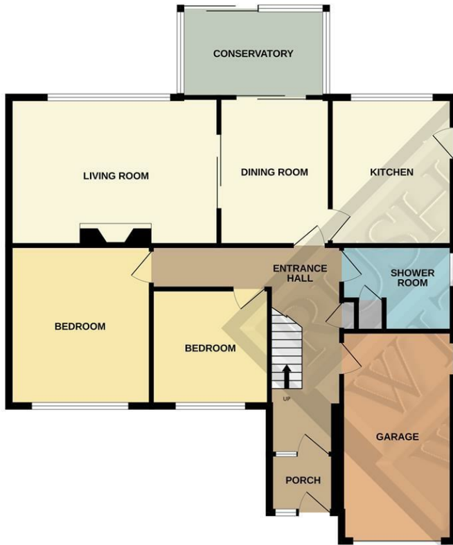
GROUND FLOOR 1106 sq.ft. (102.7 sq.m.) approx.